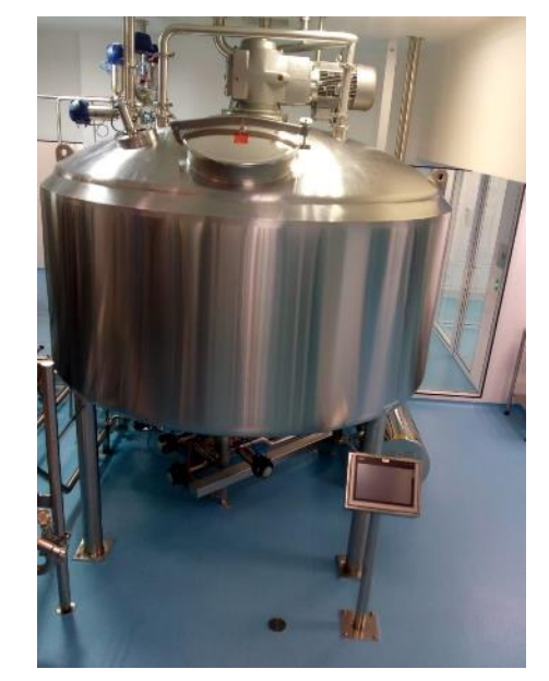
Liquid Manufacturing Reactor