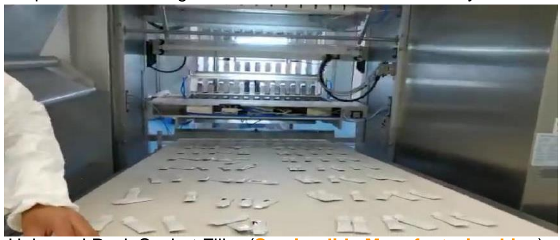
Universal Pack Sachet Filler (Semi-solids Manufacturing Line) www.genommalab.com/inversionistas/