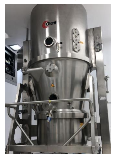
Fluid Bed Dryer