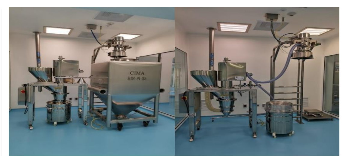
Sifter and Vacuum System (Solids Manufacturing Line)