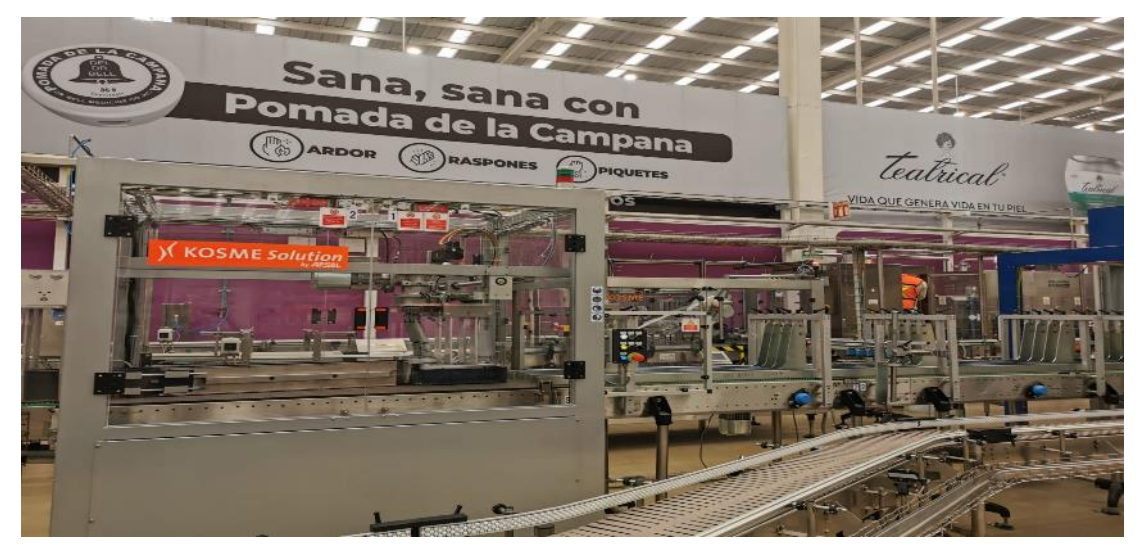
Ointments Manufacturing Line